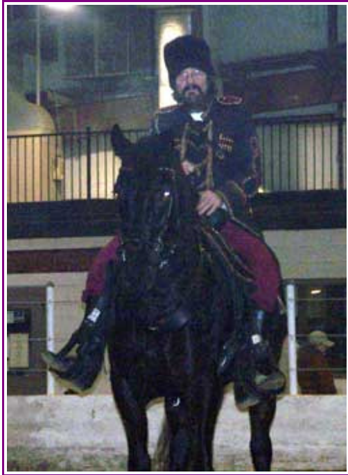
Ivan the Great